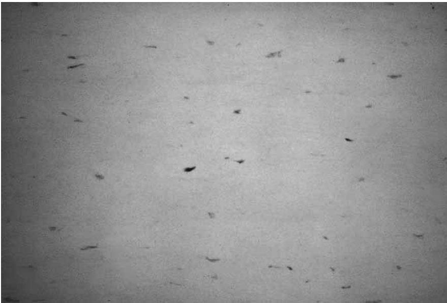
Fig. 5. Lyophilised corneal lenticule – Negative reaction for HLA-DQW1 with only very occasional cells stained (stained with diaminobenzidine and haematoxylin, light microscopy, \times 64 ).

nants. Keratocytes in organ cultured corneas and epikeratophakia lenticules showed positive staining for HLA class I, as expected. A variable degree of staining for some class II antigens in both organ cultured corneas and lenticules was noted, although this finding has not been reported before. Previous workers have not seen class II antigens on keratocytes in fresh corneas (Pels & van der Gaag 1984), nor in corneas preserved in McCarey-Kaufman medium (Whitsett & Stulting 1984). Class II antigens have been