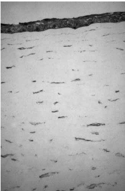
Fig. 2. Organ cultured cornea – Stromal keratocytes show positive reaction for HLA-ABC. HLA I (ABC) is also present in the epithelium (stained with diaminobenzidine and haematoxylin, light microscopy, \times 64 ).

were detected on 100% of the stromal keratocytes and about 10% of cells demonstrated positive reaction for HLA-DR antigens, the remaining antigens were not detected. The epithelium, where present (in 2 corneas), demonstrated a strong positive reaction for class I (Fig. 2), but epithelial staining for class II was questionable. Presence of antigens on the endothelium could not be assessed due to paucity of cells in this layer.