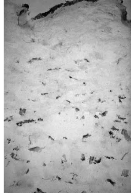
Fig. 6. Lyophilised corneal lenticule after 24 hours incubation in BSS – No apparent change in the expression of HLA-ABC antigens. Stromal disorganisation following prolonged incubation in BSS. Positive staining seen in residual epithelial cell debris (stained with diaminobenzidine and haematoxylin, light microscopy, \times 100 ).

We used an organ culture system similar to Pels (Pels & van der Gaag 1984), but preserved the corneas for much longer periods of time (Table 1) and this