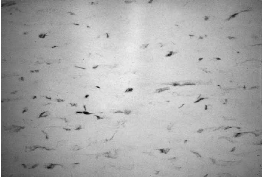
Fig. 4. Lyophilised corneal lenticule – About 70% of nucleated stromal cells show positive reaction for HLA-DR (stained with diaminobenzidine and haematoxylin, light microscopy, \times 64 ).